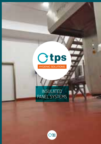
Insulated Panel Systems