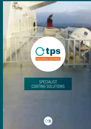
Specialist Coating Solutions