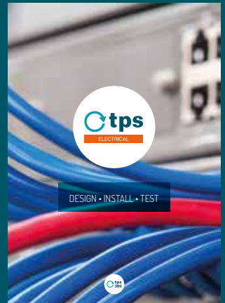
Design • Install • Test