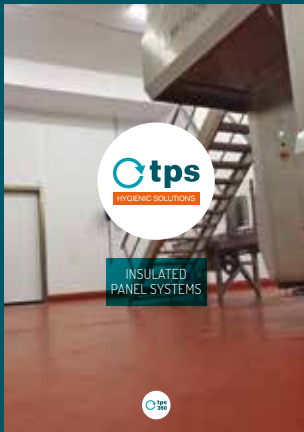
Insulated Panel Systems